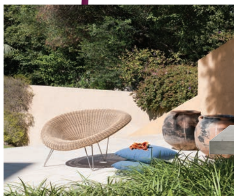
TOP TO BOTTOM: Zimmer & Rhode Accordo pillow, price upon request; Forest armchair, $845, and Fibonacci collection, JANUS et Cie.