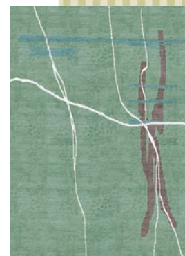
TOP TO BOTTOM: Kravet Soleil fabric; Perennials outdoor rug, price upon request; Seasonal Living square cube, $585.

SOFTLY DOES IT Fully upholstered outdoor furniture is ready for its moment. Not only is Sunbrella fabric made to withstand the elements, but so are the frames, inner support systems, and cushion fills.