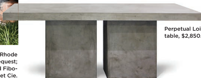
Perpetual Loire table, $2,850.